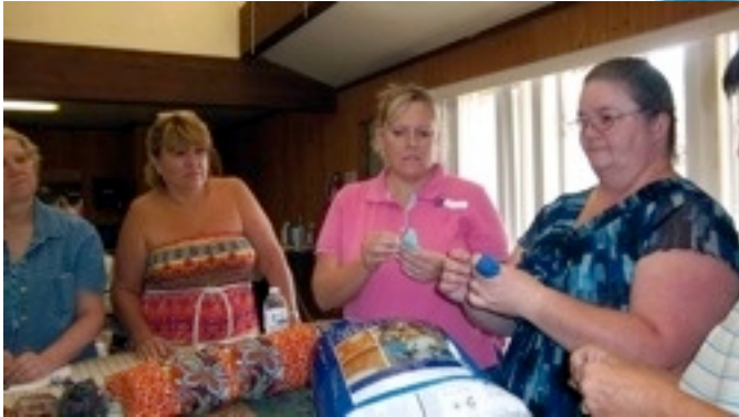
Finger Pincushion demo