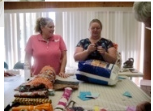
Trash Tote and Finger Pincushion